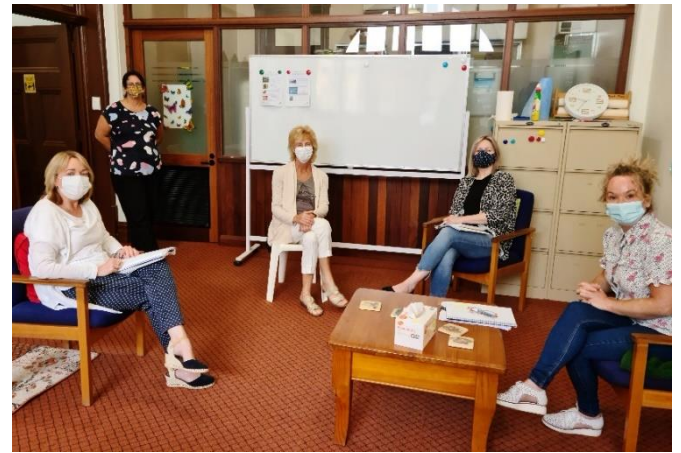
Staff meeting - Covid related restrictions 8-2-21