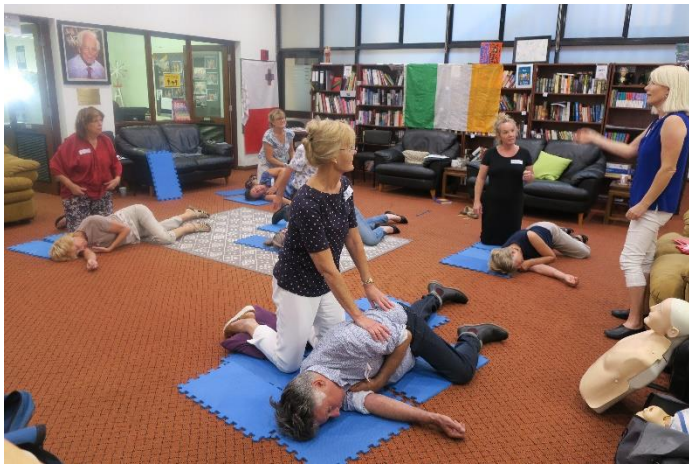
CPR training -21-1-21

I will admit that all the people I have spoken to on Tuart place Zoom have given me a good feeling of welcome. I have got some idea of where they come from and their background. Also how they have coped after arriving in Australia. As a one month old child I was placed into a Catholic Orphanage in Nazareth house in England. I recall a few events prior to arriving in Western Australia. One of the recollections was occasionally we would go to someone's place for a weekend visit. I had a good friend called Brian, and we were all assembled in the hall and asked who would like to go to Australia, thinking it was another weekend away we both put our hands up to go. I was adopted and the people who adopted me were the best I could ask for. "I have met some very nice people on Zoom and in person and Jan and I hope we will be able to keep the contacts going. This is just a small insight to my past.