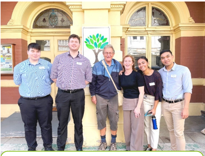
UWA Podiatry students and their lecturer held a free Podiatry Clinic at Tuart Place where they provided basic foot assessments and treatments.